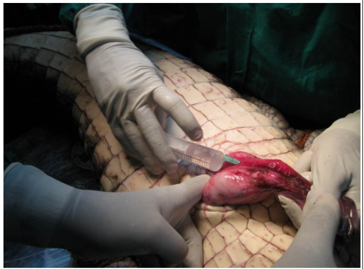
Plate 2: Retracted phallus infiltrated with 2% lignocaine