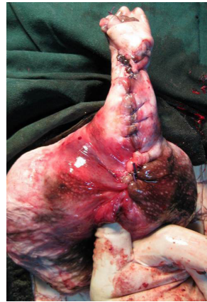
Plate 4: Ablated sulcus spermaticus and sutured mucous membrane