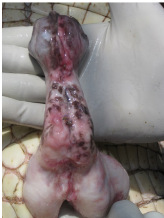
Plate 5: Examination of phallus after 8 months – no signs of regeneration of groove