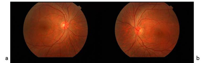
Figure 3: Fundus image: a) Normal right eye, b) Complete resolution of the lesions after 4 weeks.