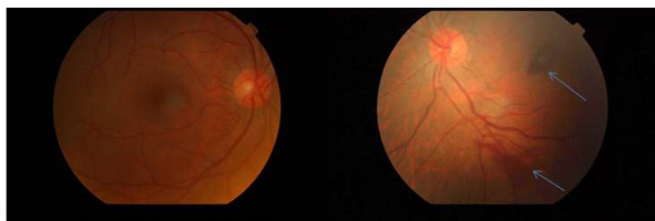
Figure 2: Fundus image: a) Normal right eye, b) Retinal and foveal haemorrhage in Left eye shown by arrows