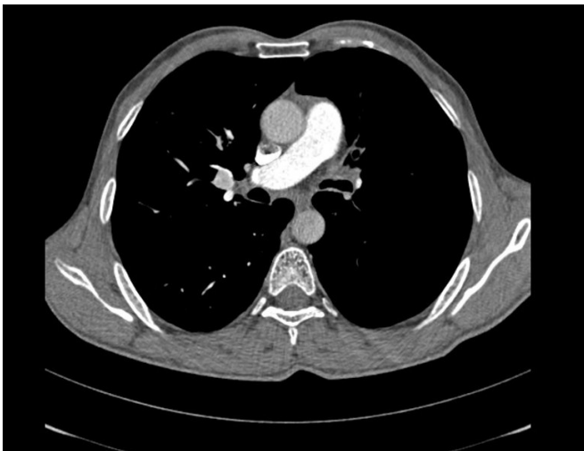
Figure 3: Pulmonary angiogram showing no contrast in the left pulmonary artery.