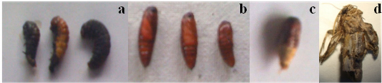
Figure 1: (a) Prepupal mortality, (b) difference in pupa size and (c) morphological deformities in S. litura at 400 and 800µg/ml concentrations