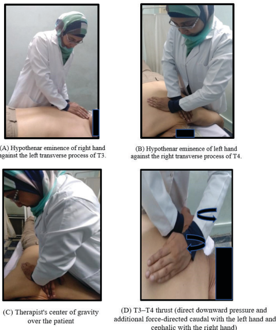
Figure 1: Hand placement for the Screw manipulation.

Patients in group B only received TM. A rotation gliding thrust, parallel to the apophyseal joint plane, was used by the screw technique to induce joint cavitation at T3–T4 using the hypothenar eminence of the left and right hands. The patient was asked to lie prone. On the patient’s left side, the therapist stood as upright as possible and resisted crouching, as this would restrict the technique and limit the thrust delivery. The therapist ensured that when applying forces against the transverse processes, good contact was made that did not slide over the skin. By leaning the bodyweight forward onto the arms, the therapist’s centre of gravity was shifted over the patient. Direct downward pressure and additional force-directed caudal with the left hand and cephalic with the right hand on the transverse processes were applied. Pre-Thrust tension was achieved by positioning the T3–T4 segment toward the end range of the available joint gliding. Then applied a downward and cephalic high-velocity, low-amplitude thrust against the transverse process of T3 while simultaneously applying a downward and caudal thrust against the transverse process of T4 23 (Fig. 1).