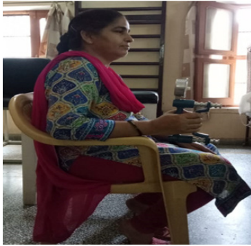
Figure 1: Shows assessment of hand grip.

Assessment and examination: Patients were thoroughly assessed and examined by using palpation and prone leg length test to evaluate cervical malalignment. Functional movements were examined for any limitation and dysfunction. Special tests like Spurling test and slump test were used to exclude specific pathologies.