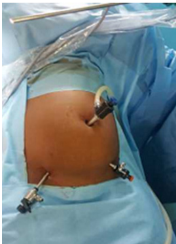
Figure 1: Intraoperative Port Placement.