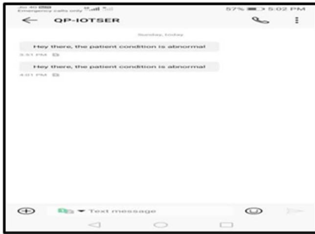
Figure 3: SMS Alert Message.

ously by the Doctor using their smart phone. Using parameters of Ubidots, the ECG graph will be sent to cloud. The experimental results that are obtained from the implemented prototype were found to be accurate. Because the system is up to sense the data and then through the internet it transmits the data that has been sensed. Since the last few decades, heart diseases are becoming a greater issue and many people lost their lives because of such health problems. Hence, the heart disease cannot be taken lightly. By analyzing and continuously monitoring the ECG signal at the initial stage, heart disease would be prevented (Figure 3).