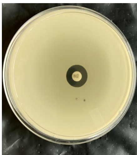
Figure 1: MRSA detection by cefoxitin disc diffusion test.