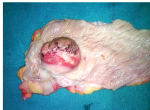
Figure 1: Angioliipoma as Lead Point in Colocolic Intususception Intra Operatively.

was managed initially by nil per oral, intravenous fluids and antibiotics and with Ryles tube aspiration and a decision of emergency laparotomy was made and proceeded.