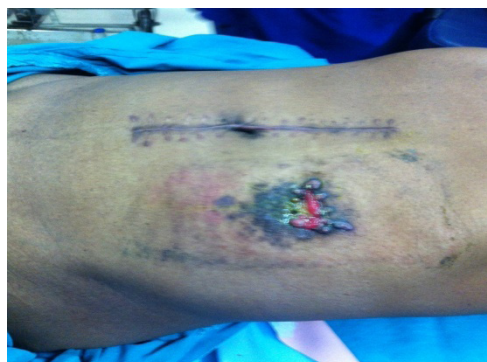
Figure 2: Post Operative Picture of Colostomy.