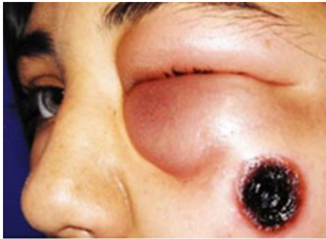
Figure 1: Cutaneous Infection.