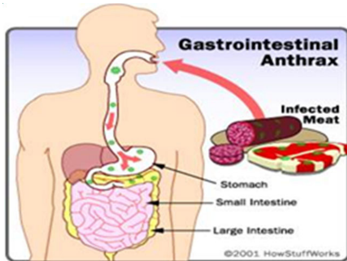
Figure 2: Gastrointestinal Infection.