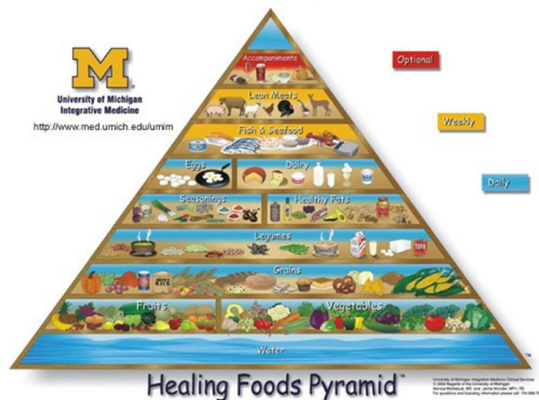
Figure 2: Healing Foods Pyramid.

Based on the concern, a food pyramid for the patient has been proposed by the University of Michigan Health System 18 . It is known as healing foods pyramid and it was built upon the needs of the patient. It emphasizes foods that nourish the body and contains healing qualities and essential nutrients that able to sustain energy over time. Apart from the normal food pyramids, it focuses on the nutrients that able to supply body energy and vitamins to boost the body recovery 18 .