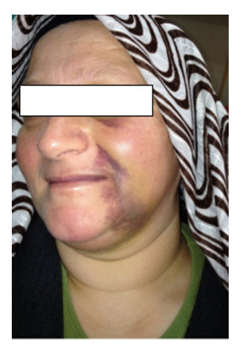
Figure 1: Hematoma after implant surgery in left maxilla.