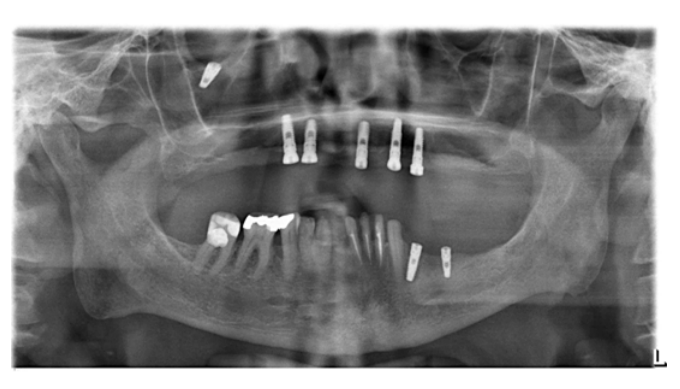
Figure 3: Radiographic appearance of a displaced implant into the maxillary sinus.