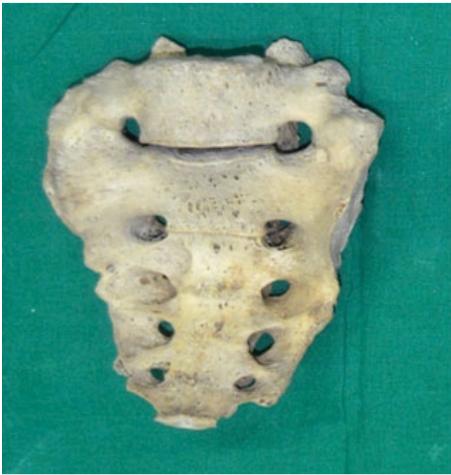
Figure 3: Incomplete fusion (Bilateral sacralisation).