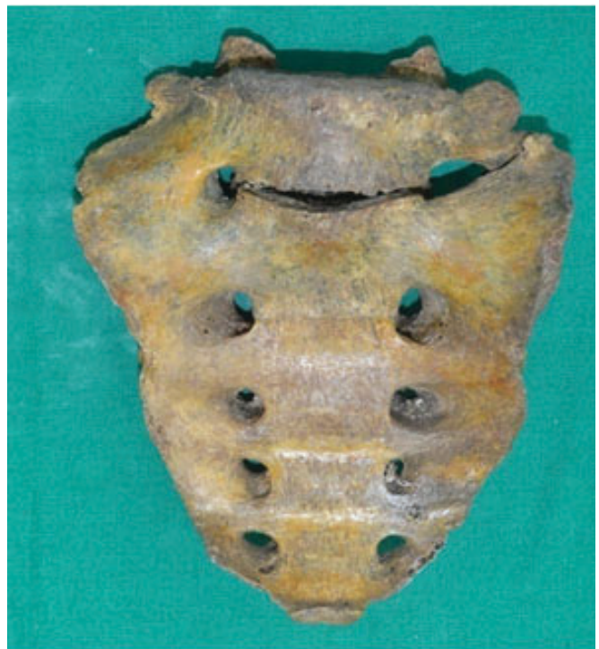
Figure 4: Incomplete fusion (unilateral sacralisation).