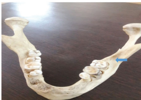
Figure 2: Retromolar Foramen on the Left Side of Mandible in Triangular Fossa.

Mandibles showing signs of pathology or other processes which may have influenced result (osteopetrosis, advanced alveolar bone resorption in the retromolar area) etc. and mandibles with the signs of damage to the retromolar area whether due to the ageing or handling of mandibles were excluded.