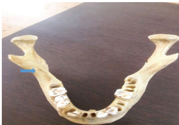
Figure 1: Retromolar Foramen on the Right Side of Mandible in Triangular Fossa.

In this study all available 72 dry, fully ossified adult mandibles from the department of Anatomy, Shri Guru Ram Rai institute of medical and health sciences, Dehradun, Uttarakhand north region of India were included without gender and age distinction. In 72 dry mandibles each mandible was observed for morphological variations that is retromolar foramen and the mandible with foramen were evaluate for the diameter of retromolar foramen along with side preference(Fig no.1 & 2).