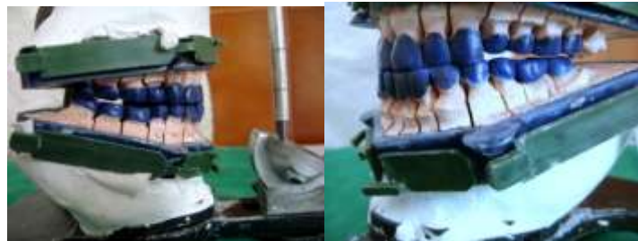
Figure 7: Condition II with canine guided occlusion