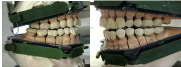
Figure 9: Completed PFM crowns with canine guided occlusion