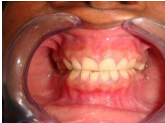
Figure 1: Preoperative view