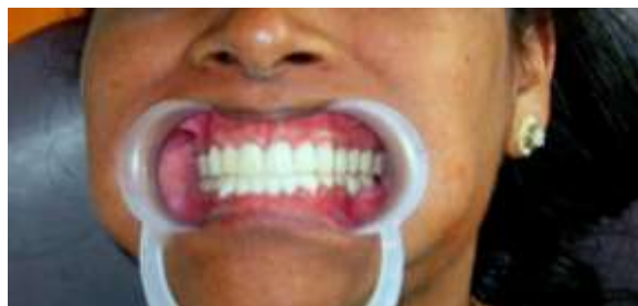
Figure 11: Intra oral view of cemented PFM crowns