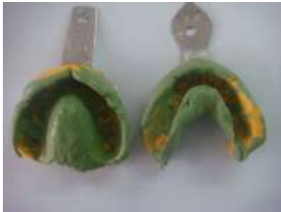
Figure 5: Maxillary and mandibular impressions