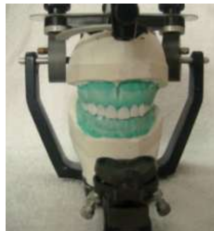
Figure 2: Maxillary and mandibular diagnostic wax up