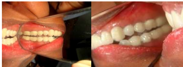
Figure 10: Intra oral view showing uniform disclusion