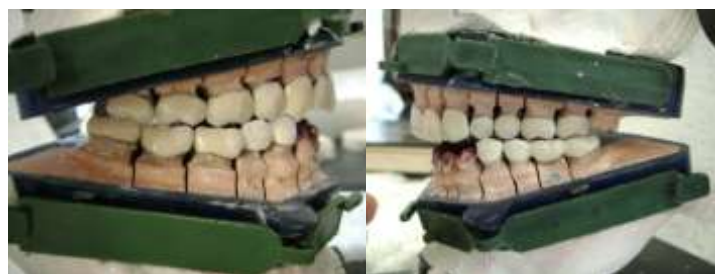
Figure 8: Completed PFM crowns (Condition I)