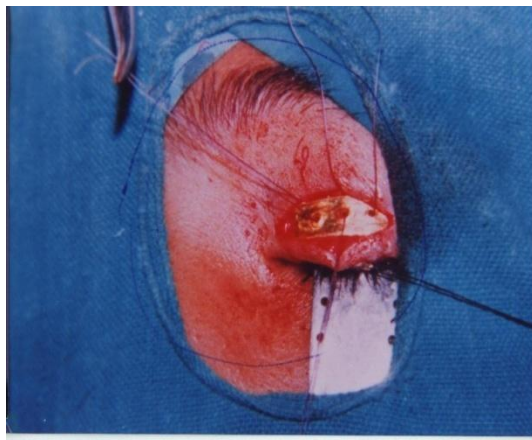
Fig 3: Operative photograph of insertion of implant