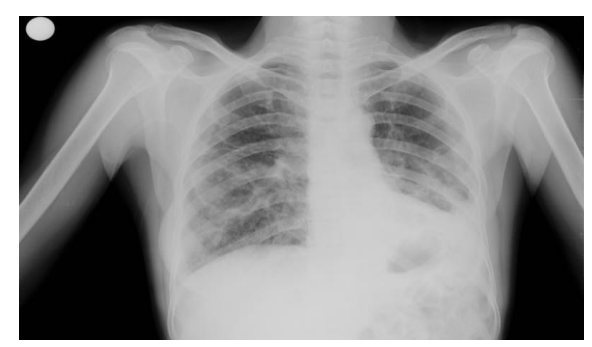
Figure 2: Chest X ray PA view showing a thin wall cavity in the right mid zone and left sided pleural effusion.