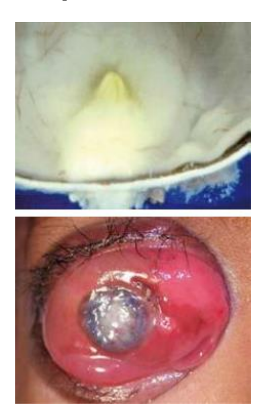
Figure 1: Diffuse Infilterative Retinoblastoma With Placoid Thickening And Retinoblastoma With Intraorbital Extension