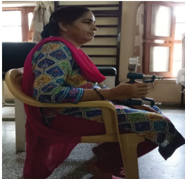
Figure 1: Shows assessment of hand grip.

Assessment and examination: Patients were thoroughly assessed and examined by using palpation and prone leg length test to evaluate cervical malalignment. Functional movements were examined for any limitation and dysfunction. Special tests like the Spurling test and slump test were used to exclude specific pathologies ( Fig. 1).