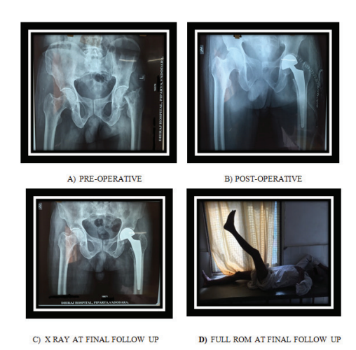
Figure 1: 60 years male patient with left side subcapital neck femur fracture operated with modular bipolar hemiarthroplasty.