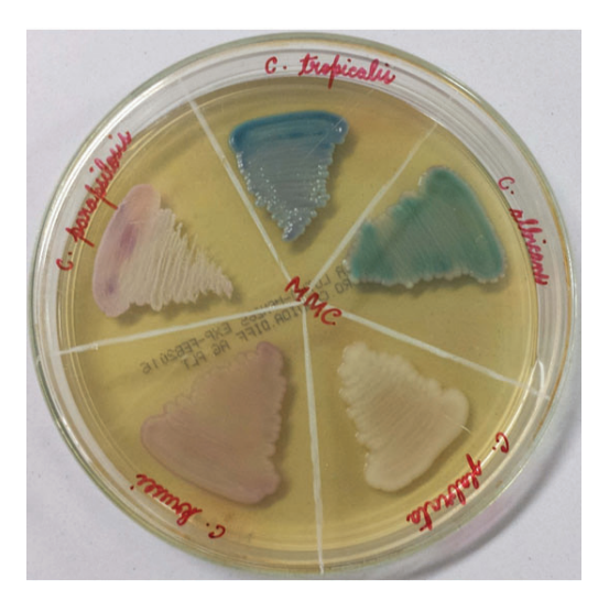
Figure 1: Speciation of Candida spp in Candida Chrom agar.