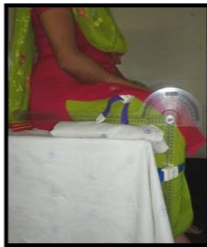
Figure 2: Alignment of the Goniometer