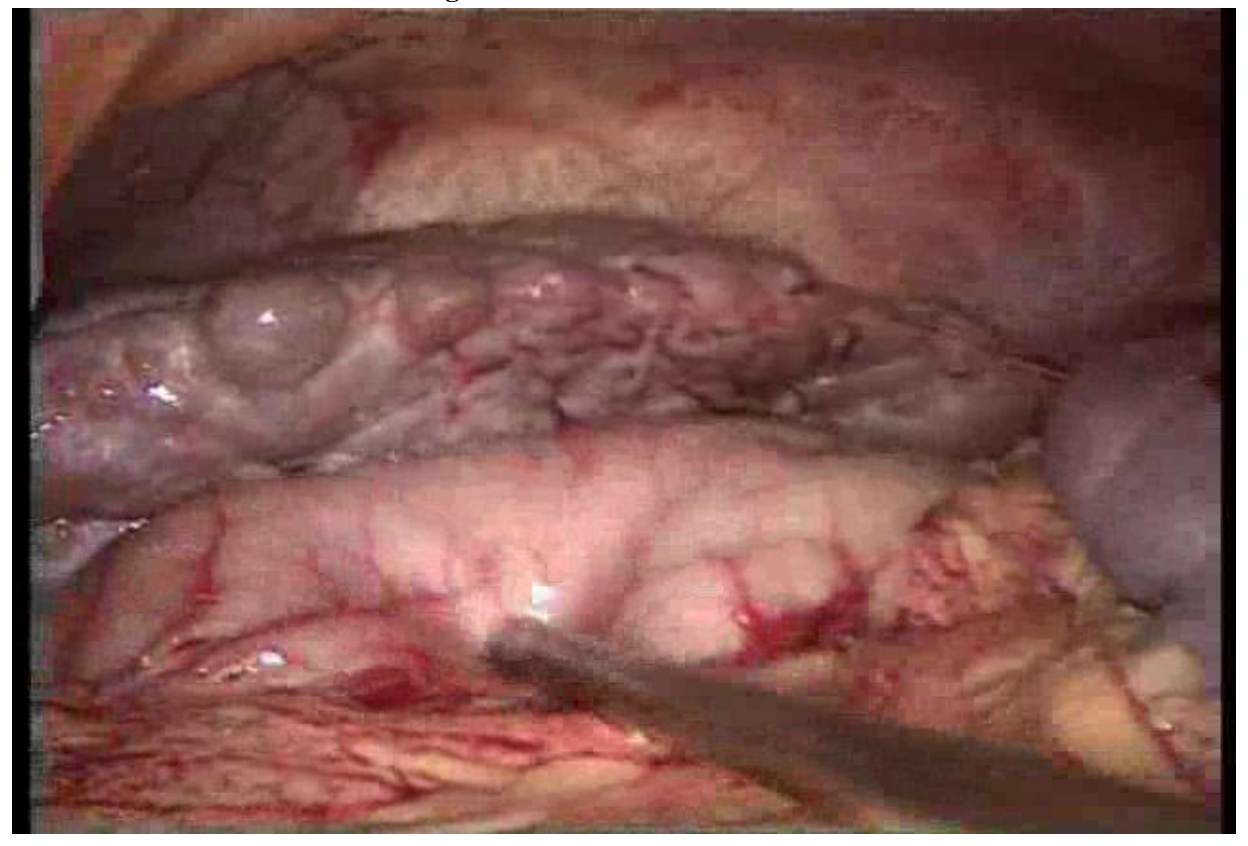
Figure-3- Hemoperitoneum- cirrhotic liver- splenomegaly