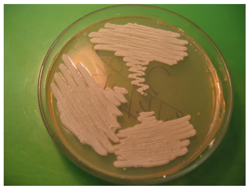
Figure 1: Colonies were seen on Sabouraud dextrose agar (SDA) Tiny, creamy- white, dry, wrinkled colonies were seen on Sabouraud dextrose Agar (SDA)